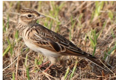
Nesting ground for larks