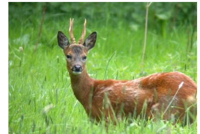
Food for deer