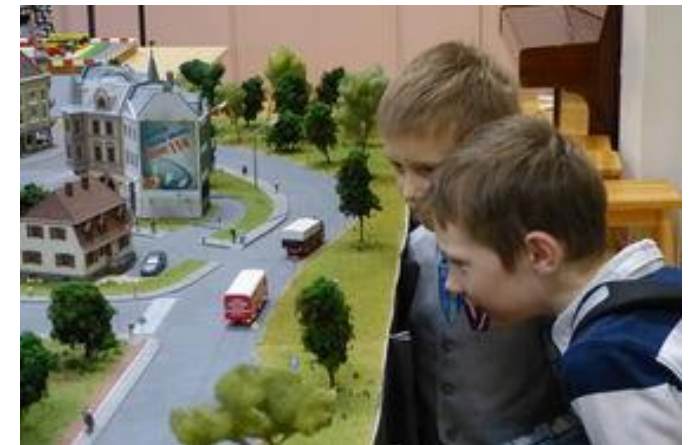
Family with children