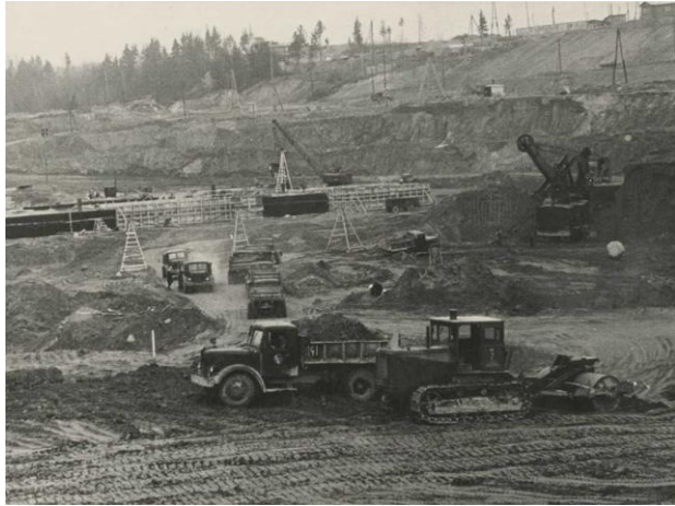
It started work in December 1965.