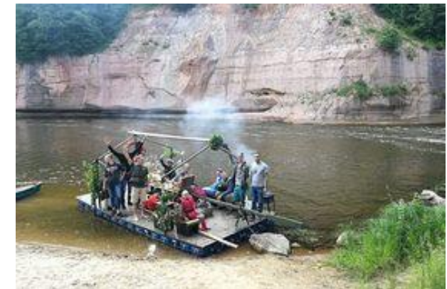
Boat, raft and bike rental