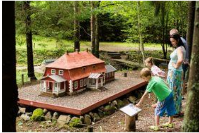
Miniatures of the historical buildings