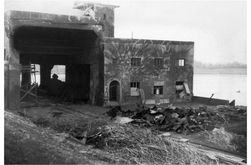
After World War II