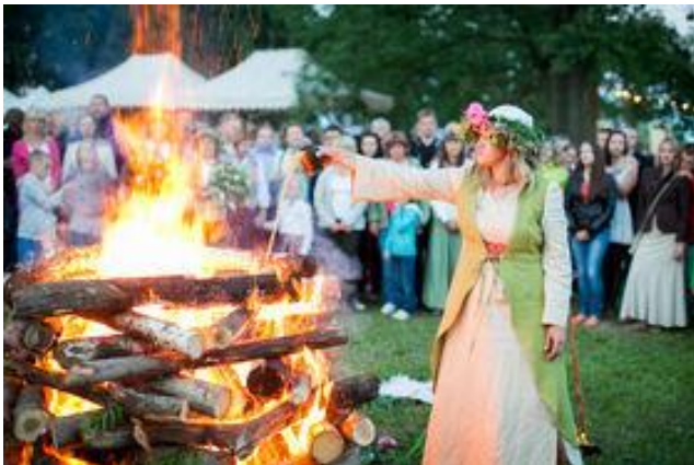
Live music , food , opera and another festivals