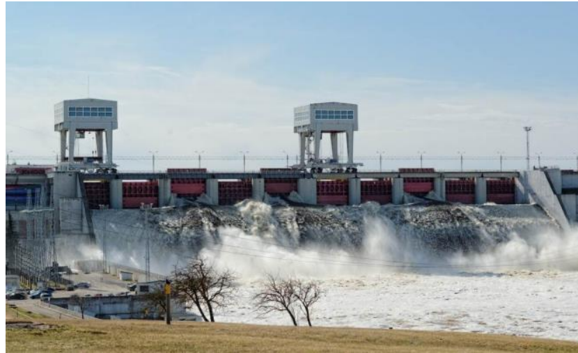
HPP opens the locks