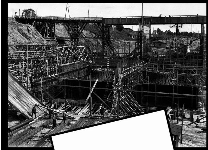
1936-1940 g. - construction