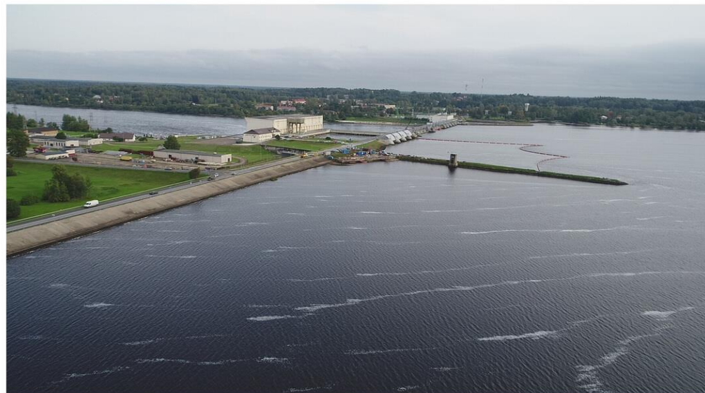
2015 – reconstruction